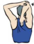
Overhead Shoulder Stretch