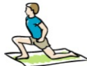
Forward Lunge Stretch