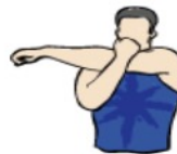
Posterior Shoulder Stretch