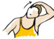
Side to Side Neck Stretch

To ensure that muscles break down any lactic acid, thus improving recovery time and help to prevent cramp.